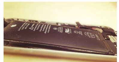
Figure 1: Swollen lithium-ion accumulator

You have transported your drone from ETH to a destination somewhere in Switzerland, where it has crashed. Can you transport the drone and the lithium-ion accumulator back to ETH in your vehicle?